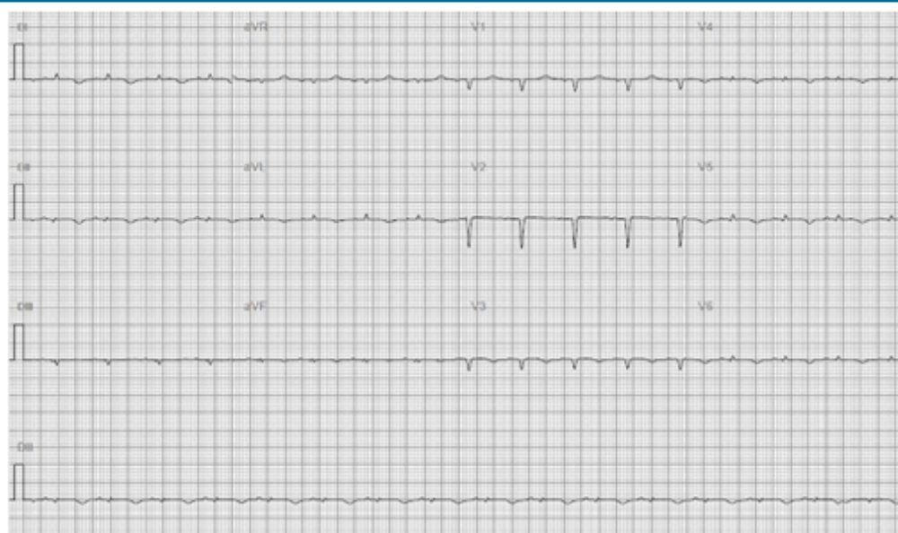
Figure 1 – The electrocardiogram (ECG) showed sinus rhythm, low QRS amplitude and a pseudoinfarction pattern.

A smaller number of patients with HCM (5-10%) will progress to an end-stage form of the disease that is characterized by LV dilation, wall thinning and systolic dysfunction. 6 Despite the absence of systemic disease, the relationship between increased wall thickness, low ECG amplitude and severe diastolic dysfunction favors the diagnosis of a restrictive cardiomyopathy. Gadolinium enhancement was also typical for cardiac amyloidosis. In addition, there was no history of familial cardiac disease. Although endomyocardial biopsy even ruled out the diagnosis of cardiac amyloidosis, it also failed to confirm HCM, probably because the right ventricle was less affected.