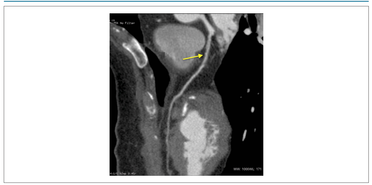
Figure 3 – Multiplanar reformation of coronary computed tomographic angiography, detecting a severe parietal irregularity in the proximal third of the anterior descending coronary artery, which suggested the presence of a noncalcified plaque or dissection of the artery (arrow).