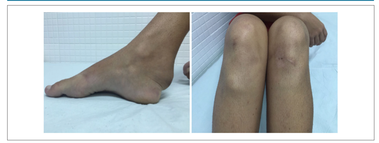
Figure 1 – Xanthomas observed on the region of the right Achilles tendon and on the right knee.