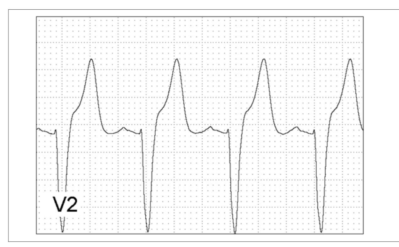
Figure 3 – S/T ratio < 1.8 in V2.

There were no external funding sources for this study.