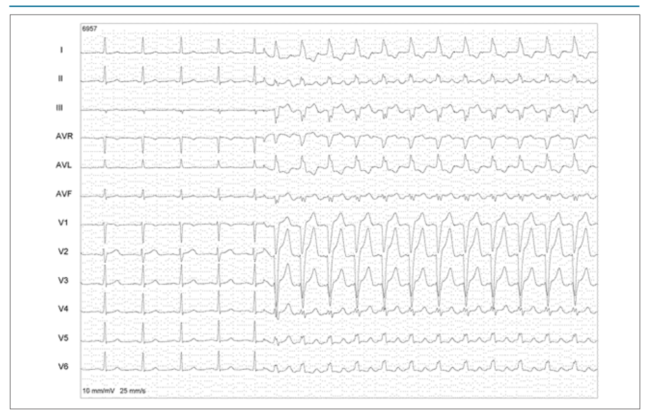
Figure 1 – 12-lead ECG of the onset of pain immediately after left bundle branch block