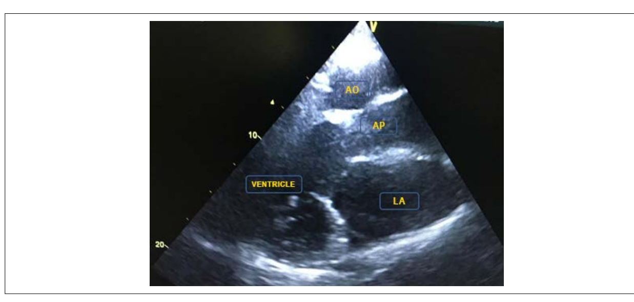
Figure 3 – Long axis, parasternal view showing the transposition of the great arteries. 254x190mm (96x96 DPI).