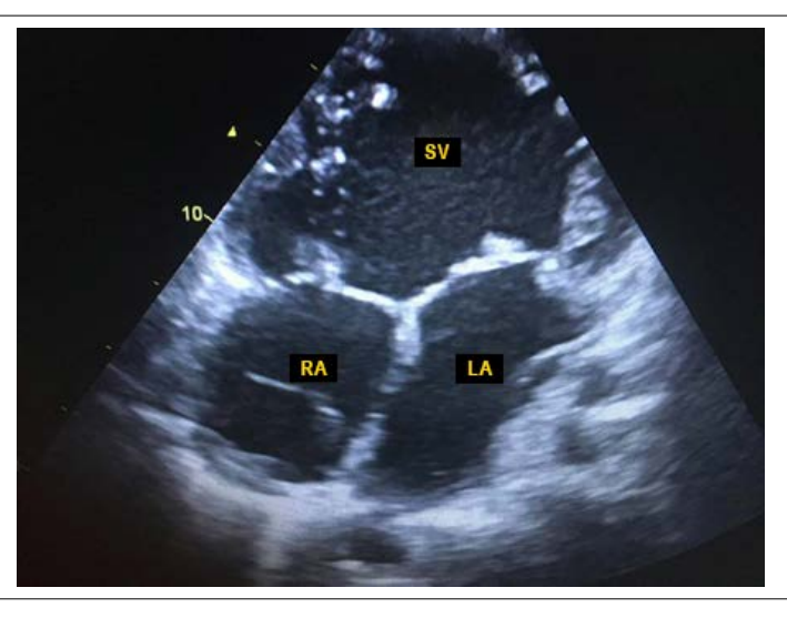
Figure 1 – Transthoracic echocardiography: apical view, showing single ventricle and no evidence of recorded interventricular septal tissue. 254x190mm (96x96 DPI).

The echocardiography was essential for the diagnosis of double-inlet single ventricle, but it is not always possible to establish the type of ventricle, i.e., whether it is right or left, since it becomes difficult to be certain there is no second rudimentary ventricle. In these cases, magnetic resonance imaging is required for diagnostic complementation.